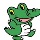
Dr. Wani, OU mascot

The tutoring system is to match each international student with a student tutor (a senior student at the Graduate School of Economics), who acts as a personal guide to your new life in Osaka. The tutors assist international students with their studies at Osaka University and advice on the practical and psychological aspects of living in Japan. You will be introduced to your tutors after you arrive in Japan.